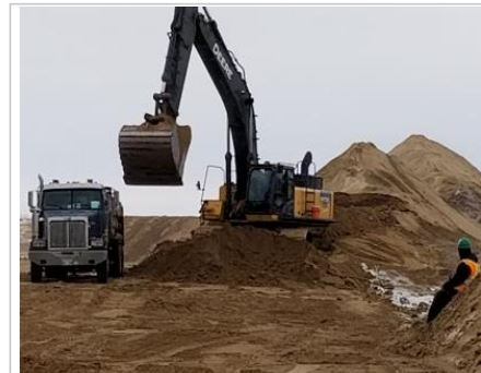
Description & Location KP-843+400

Photo taken facing east. Walked into the wetlands. Clean and organized. Ephemeral temporary marsh Class 1 & 2. MB-53.