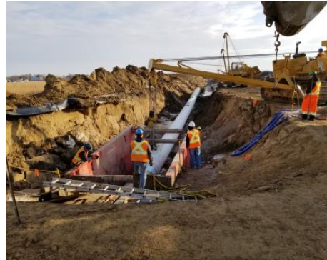
Description & Location KP-836+409.1

Photo taken facing north. Dozer leveling off the right away.