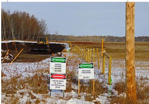
Photo taken facing east. Workers spraying the beet juice onto the topsoil.