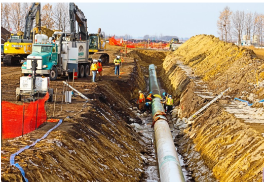
Description & Location: SSKP 826+645

Photo taken facing east. Workers guiding the excavator to backfill the pipe at the open ditch.