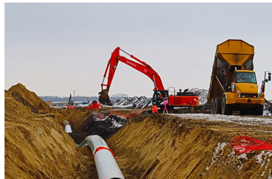
Description & Location: SSKP 836+000

Coating Tie Ins Heating the weld for applying coating They heat pipe to 120 degrees and apply at 90 degrees Working in wetlands, facing north