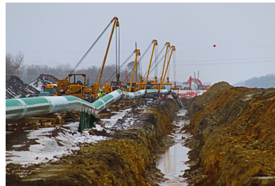
Description & Location: SSKP 859+050

Mainline Backfill Excavator backfilling trench Dozer touching up ROW Facing east