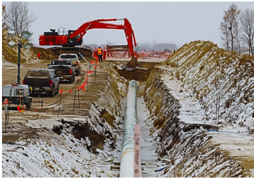
Description & Location: SSKP 826+545

Photo taken facing south. Horizontal drill being inspected by the workers.