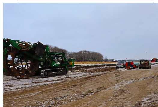
Description & Location: SSKP 855+072

Lower In Crew Using larger generator to pump water On sling is the pump that the Boom lowers In wetlands photo facing southwest