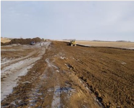
Description & Location KP-827+600

Photo taken facing north. Dozer leveling off the right away.