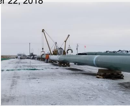
Description & Location KP-904+100

Photo taken facing east. Coating crew coating the pipe .