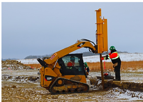
Description & Location: SSKP 849+930

Tie In Backfill, facing east Excavator backfilling ditch and packing soil Rock Truck unloading soil for backfill