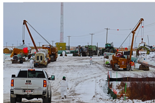
Description & Location: SSKP 902+102

Two Badger Hydro-vacs Cleaning out pig pens with suction hose They break it up with high pressure water Tie In Backfill in area, facing southwest