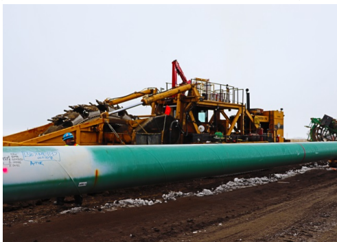
Description & Location: SSKP 860+000

Lower In Crew Waiting for water to be drained Backfill working in far background Facing west