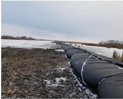
Description & Location 838+132.8

Photo taken facing east. Walked into the wetlands. Clean and organized. Ephemeral temporary marsh Class 1 & 2. MB-53.