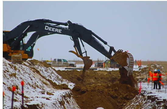
Description & Location: SSKP 827+750

Tie In Backfill Crew Excavator Backfilling trench and packing Spotter watching for clumps/rocks Photo facing west