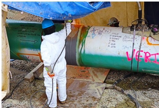
Description & Location: SSKP 834+240

Photo taken facing east. Ditch wheel digging a trench. Excavator taking the sand that is falling back into the trench.