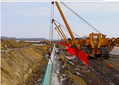
Description & Location: SSKP 832+561

Tie In Crew Excavator digging out bell hole Side Booms holding pipe in slings Facing east