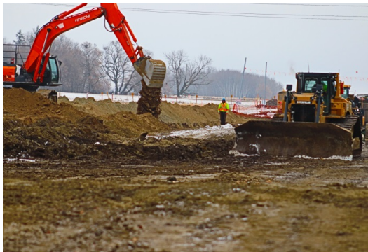
Description & Location: SSKP 858+200

Mainline Backfill Excavator backfilling trench Dozer touching up ROW Facing east