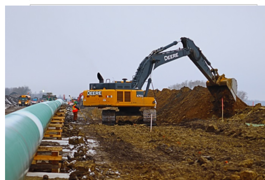
Description & Location: SSKP 861+500

Trenching Crew Working through wetlands Ground conditions soft from warm weather Facing northeast