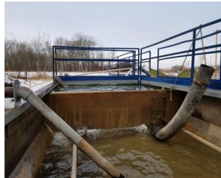
Description & Location KP-819+432.5

Photo taken facing east. Leveled off the right away. Clean and tidy.