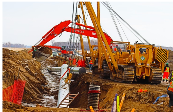
Description & Location: SSKP 829+303

Tie In Backfill Crew Cleaning out ice away from pipe Getting weld ready for rescan West of Rd #20