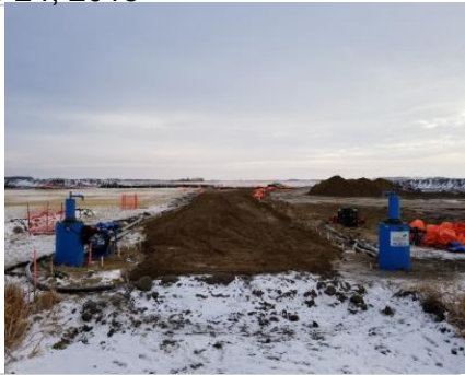
Description & Location KP-808+568.2

Photo taken facing east. Leveled off the right away. Clean and tidy.