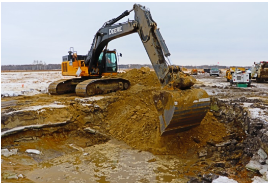
Description & Location: SSKP 836+419

Photo taken facing east. Excavator loading sand into the tandem truck. Wetland crossing MB-061.