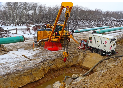
Description & Location: SSKP 854+464

HD Bores #1/Trenching/Lower In Trenching mobilizing at top left of picture Lower In waiting for trench clearance