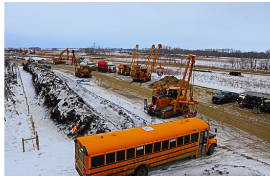
Description & Location: SSKP 854+060

Wetlands Crew Excavator preparing for open cut on Thursday They also pumped out water Facing northeast