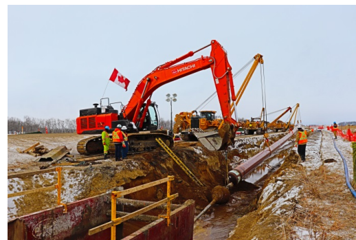
Description & Location: SSKP 853+629

Fencing Crew Skidsteer with post pounder pounding post They heat up ground with torch first Than use an auger to start a pilot hole Facing northwest