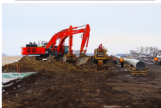
Description & Location: SSKP 860+070

Tie In Crew Workers cleaning out ice in bell hole Side Booms supporting pipe in slings Facing east