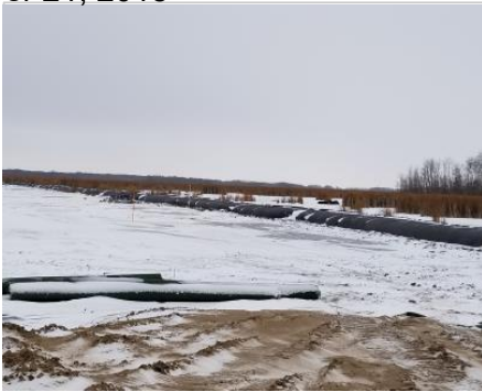
Description & Location KP-838+132.8

Photo taken facing east. Aqua dam frozen. Light snow cover on the wetlands. Ephemeral temporary marsh. Class 1 & 2.