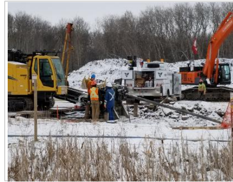
Description & Location KP- 853+629.2

Photo taken facing east. Aqua dam frozen. Light snow cover on the wetlands. Ephemeral temporary marsh. Class 1 & 2.