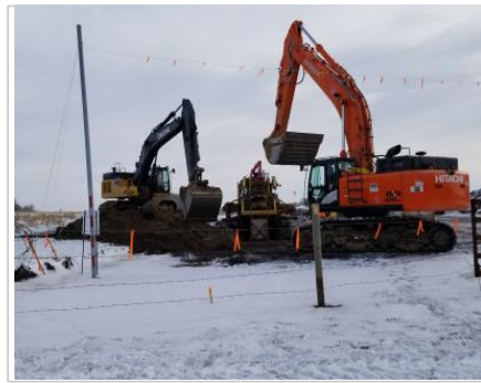
Description & Location KP-858+335.0

Photo taken facing east. Coating crew coating the pipe .