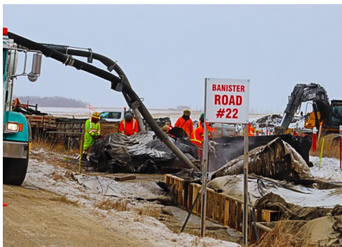
Description & Location: SSKP 829+253

Tie In Backfill Crew Two Excavators Backfilling trench The white hat (right) is Indigenous and is a Junior Inspector, facing south